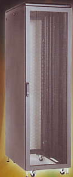
EzRak® MVS Multi-Vendor Server Version